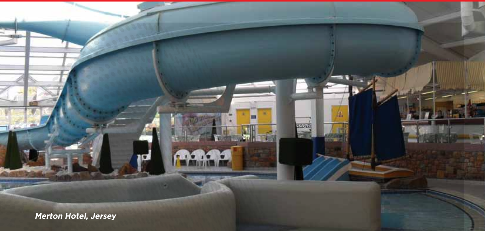
Merton Hotel, Jersey