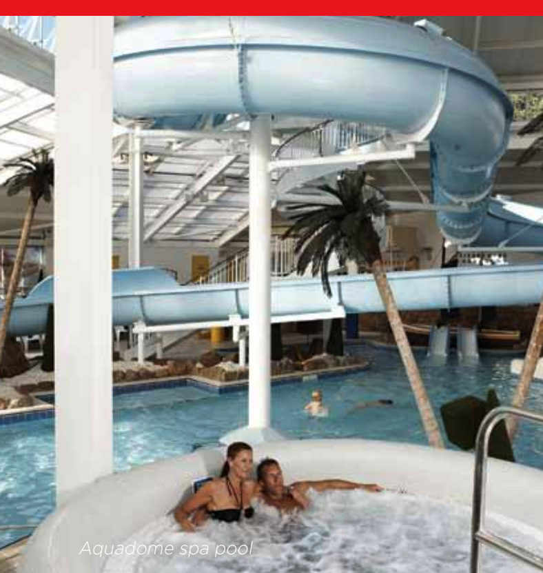
Aquadome spa pool